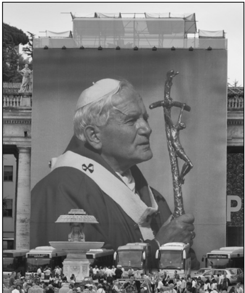
St Peter's Square, Rome 2011. Giant Banner of Pope John Paul II