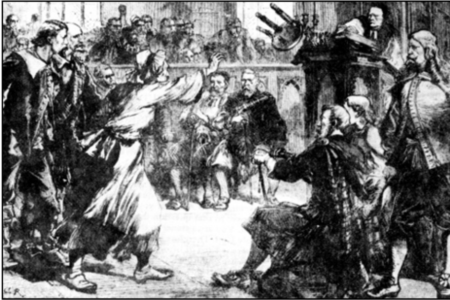
Jenny Geddes throwing a stool at the Dean of Edinburgh in St Giles Kirk

and a young teenager, Margaret Wilson, who were martyred in the Solway tied to stakes on the Wigtown sands. The older woman was tied further out in the sands, to allow the young maid to watch, in the hope this would cause her to recant. However even this cruelty could not persuade her to