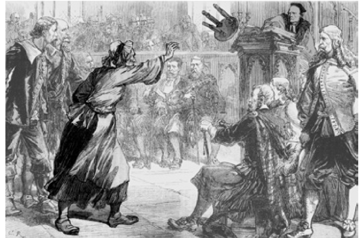
JENNY GEDDES FLINGING HER STOOL AT THE DEAN OF EDINBURGH (23rd July, 1637)

Scottish Protestants, roused into indignation, saw the system being again set up which their fathers, led by the great Reformer, John Knox, had cast down. The Reformed Church of Scotland arose in new power; the schemes of tyrants who had hoped to plant arbitrary power upon its ruins were baffled; and the nation hailed its recovered liberties with a shout of joy.