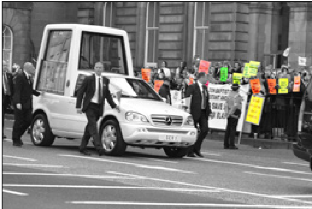
Princes Street, Edinburgh: Protestors from Zion Baptist Church confront the Pope of Rome.