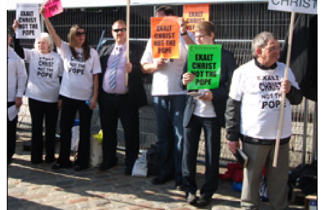
Westminster Abbey, London: Members joined a large Protestant witness against the Papacy