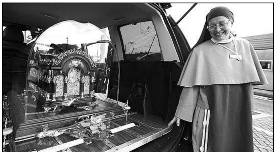
UK tour: a casket containing the bones of St Thérèse of Lisieux, arriving in Folkestone,