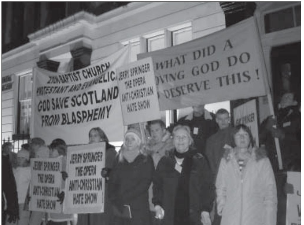
Members of Zion Baptist Church protest against this blasphemous show