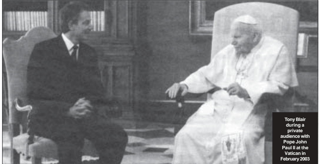
Tony Blair during a private audience with Pope John Paul II at the Vatican in February 2003

Today, he attends Mass with Cherie and their children but does not receive Communion. However, according to a priest based at Westminster Cathedral who is a regular visitor to 10 Downing Street, when he travels abroad, he always finds a