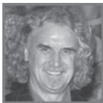
Connolly: 'Complete nuisance'