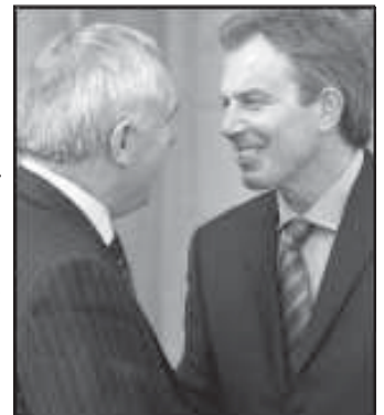
Bertie Ahern and Tony Blair