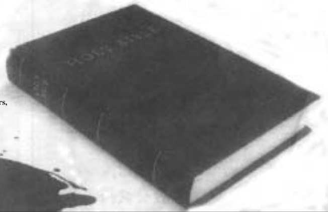
OFFENSIVE: The Gay Police Association advert using images of the Bible and blood to attack Christians

implied that the Bible and Christianity were responsible for and condoned violence against homosexuals. In its response to the ASA, the Gay Police Association said the Archbishop of Canterbury had reminded Christians that the Bible did not permit gay discrimination.